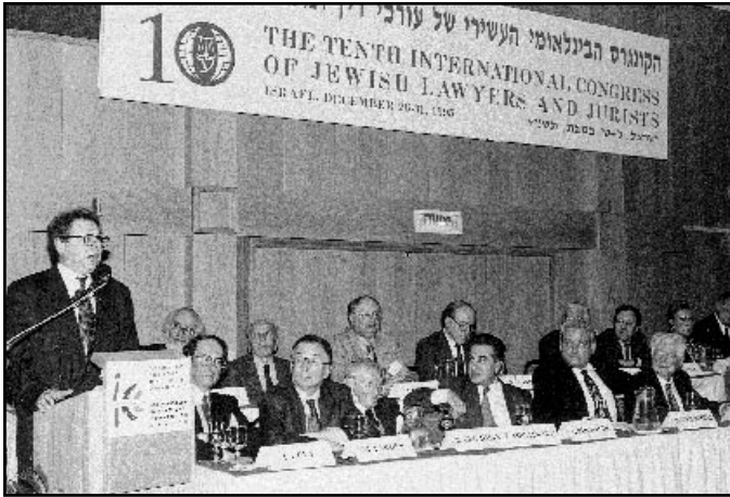
Historian Sir Martin Gilbert delivers key-note address at opening session.