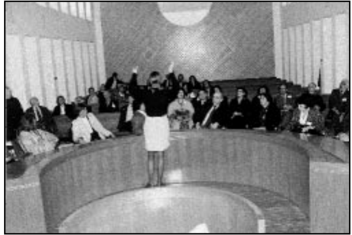
Delegates visiting the Supreme Court of Israel premises in Jerusalem.