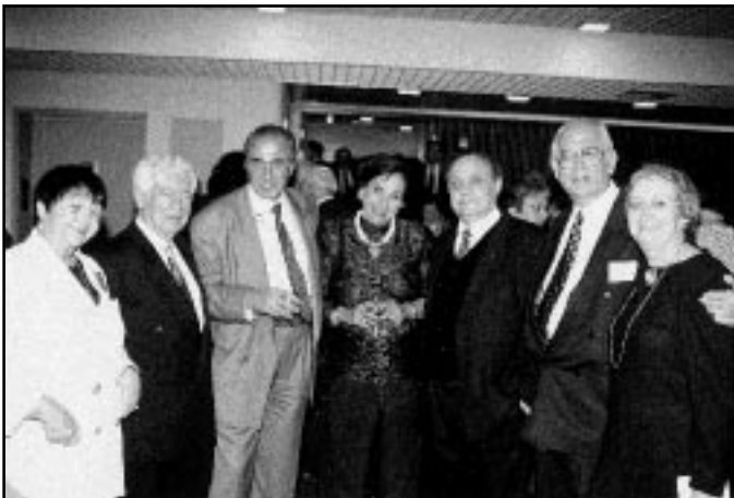
Israel Bar hosts delegates at a reception in its Tel Aviv headquarters.