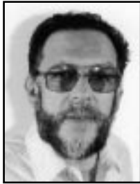
Counsel for the Petitioners