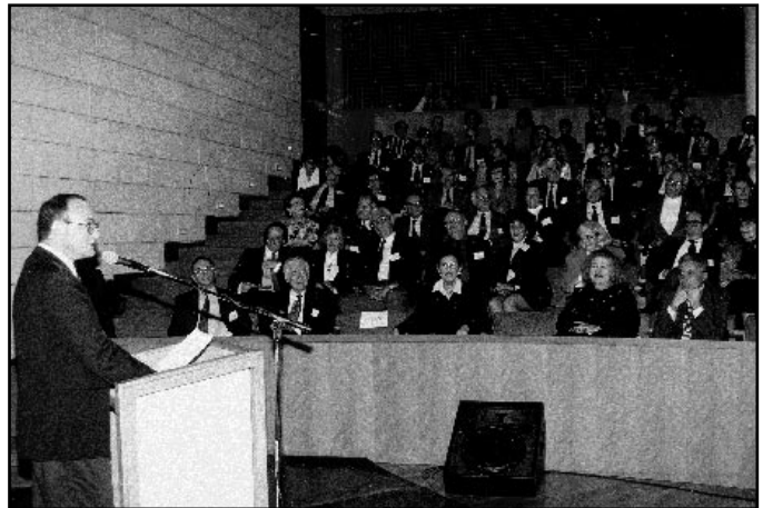
Tel Aviv Mayor Ronnie Milo addresses delegates at Enav Cultural Center.